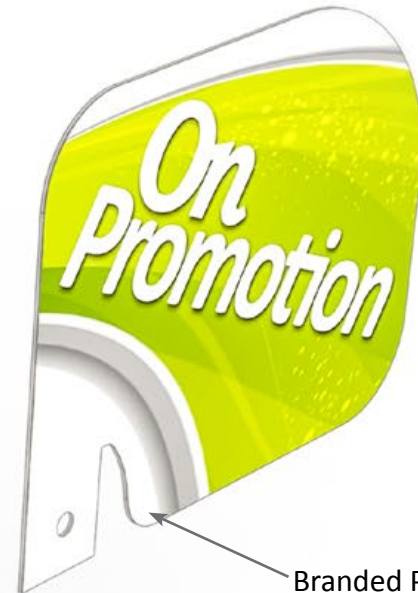
Branded POS Card